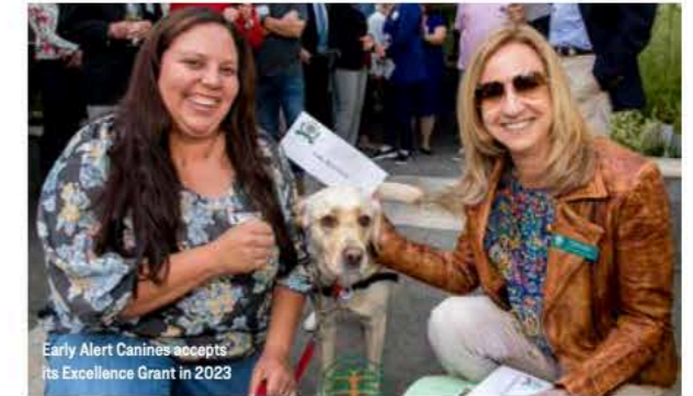
Early Alert Canines accepts its Excellence Grant in 2023

Individual donors, family foundations, and business partners and sponsors are all vital to the Community Foundation's ability to address local needs by supporting essential community nonprofits. Every donation, whether $50 or $20,000, has a meaningful impact. Those who support the Community Foundation are part of an important act of collective giving and its power to generate a sustainable impact for the next 25 years and beyond. To donate to the Community Foundation and help build a stronger Lafayette, visit CFLafayette.org.