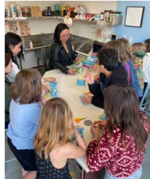
A SWELL activity for kids (photo provided)