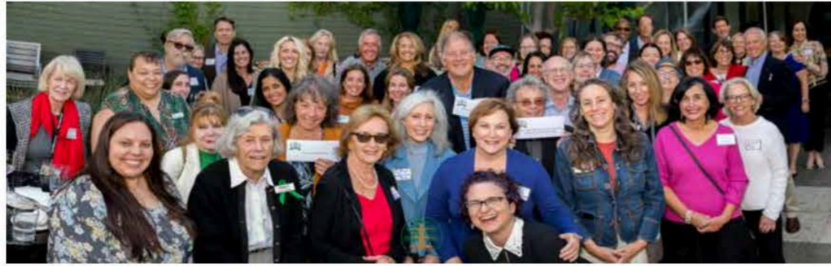
CFL's 2023 Grantee Celebration.