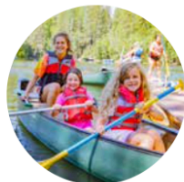
Youth Development & Education