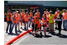
One of many projects at the 2023 Lafayette Community Day - Volunteers painting curbs at the Lafayette Community Center.

Fifteen years ago this year, the Community Foundation established the popular Senior Symposium. Every year, this event includes dynamic speakers who delve into topics tailored to the interests of our senior community as well as caregivers and family members who are in search of information and guidance for helping their aging relatives live well.