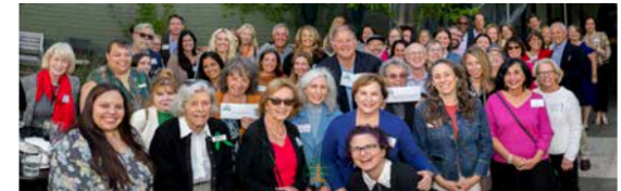
CFL's 2023 Grantee Celebration